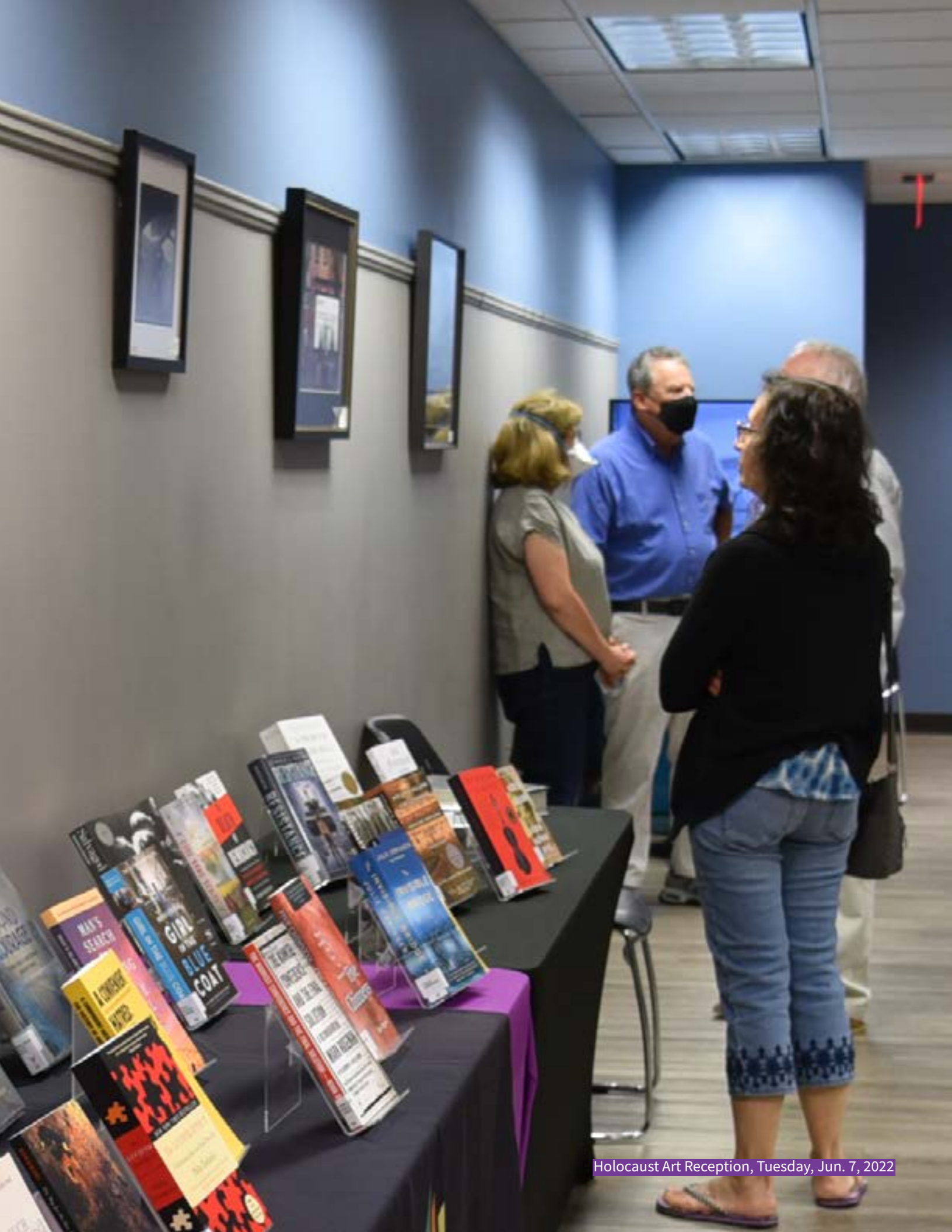
Holocaust Art Reception, Tuesday, Jun. 7, 2022