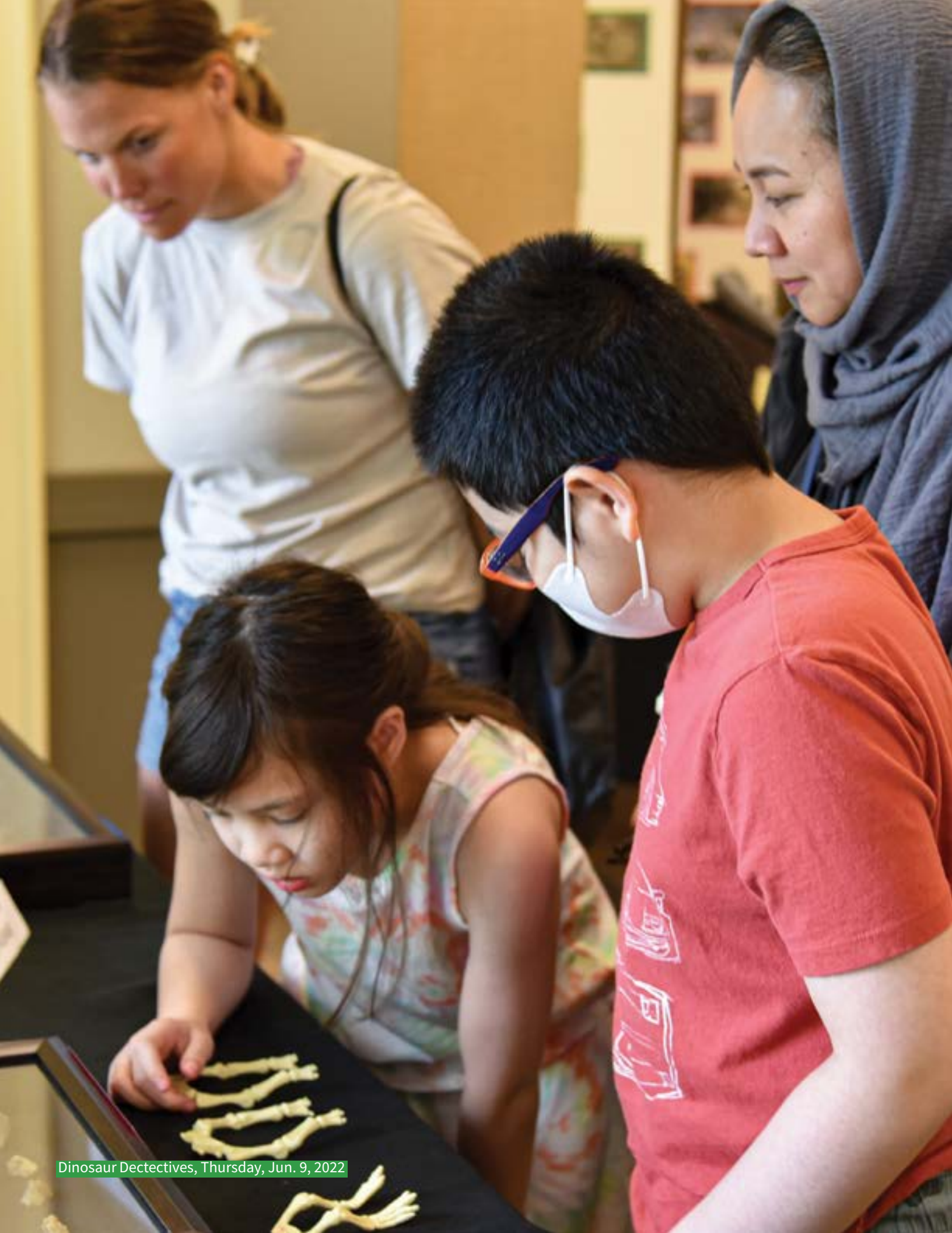
Dinosaur Detectives, Thursday, Jun. 9, 2022