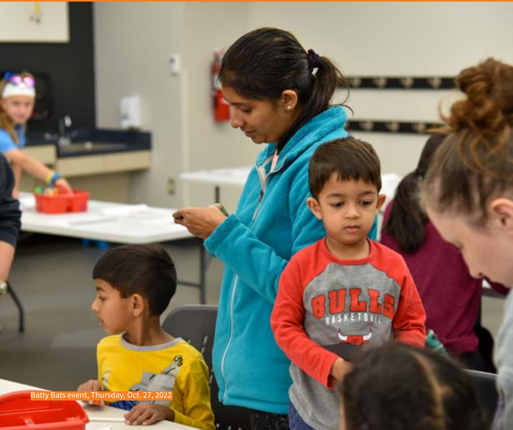
Batty Bats event, Thursday, Oct. 27, 2022

We want the public to understand the value of MPHPL while ensuring library products and services are actively communicated to our community.